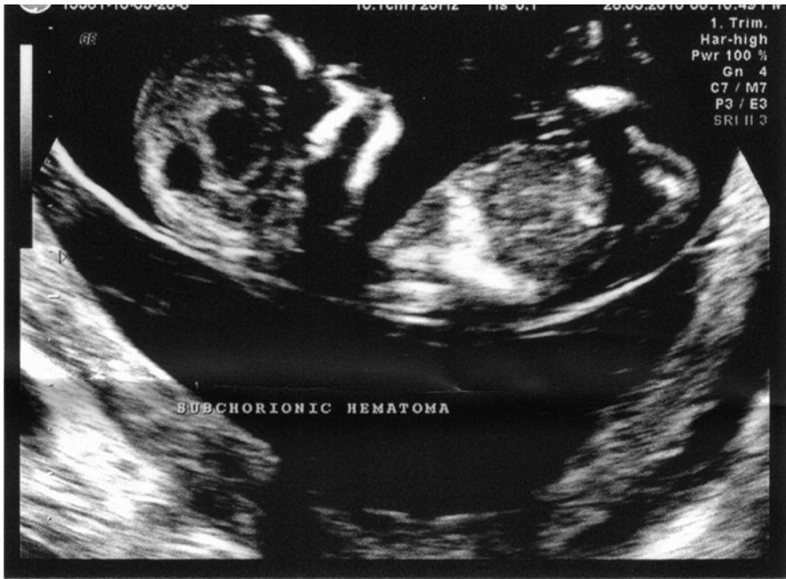
Fig. 2.1 Two-dimensional ultrasonography scan of a subchorionic hematoma in a patient who presented with first trimester vaginal bleeding